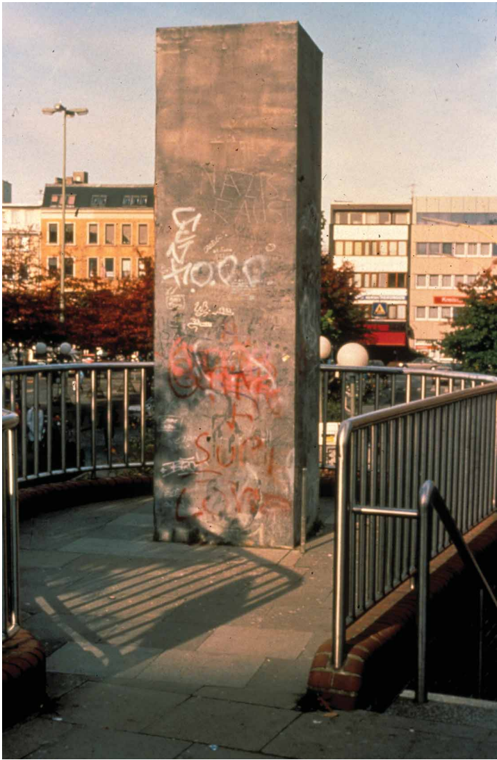
Figure 1. Jochen Gerz, Esther Shalev-Gerz, Monument against Fascism (1986/1996), Harburg-Hamburg, Germany.